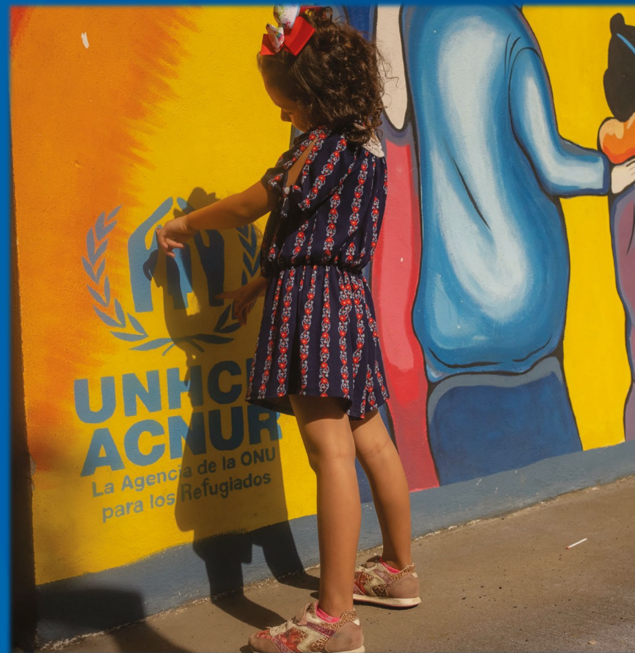
Guatemala. A refugee girl plays with her shadow in front of a mural of Solidarity Cities, near a health centre supported by UNHCR.